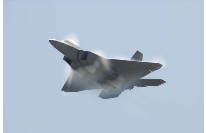
This pass actually hurt my ears. He had to be doing 480. :-)