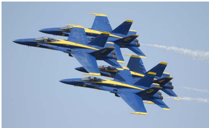
..and by Blue Angels, 18" from wingtip to canopy!