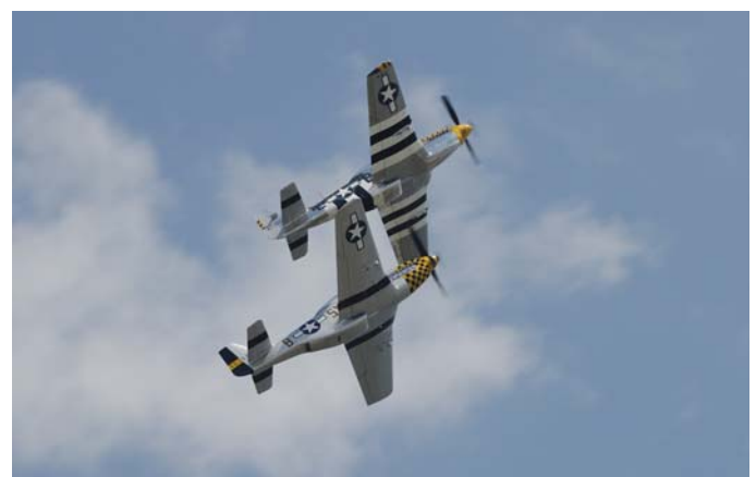
Very close formation by P-51 team...