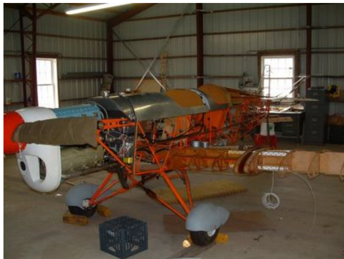
(Construction photo shown above.)

Actual aircraft is covered and painted, and essentially complete. Everything is brand new, engine, instruments and radios. Engine is a Lom Praha from the Czech Republic, used in Zlin aerobatic airplanes and in new build Bücker Jungmanns. It needs the windshields attached and test flight. $29000