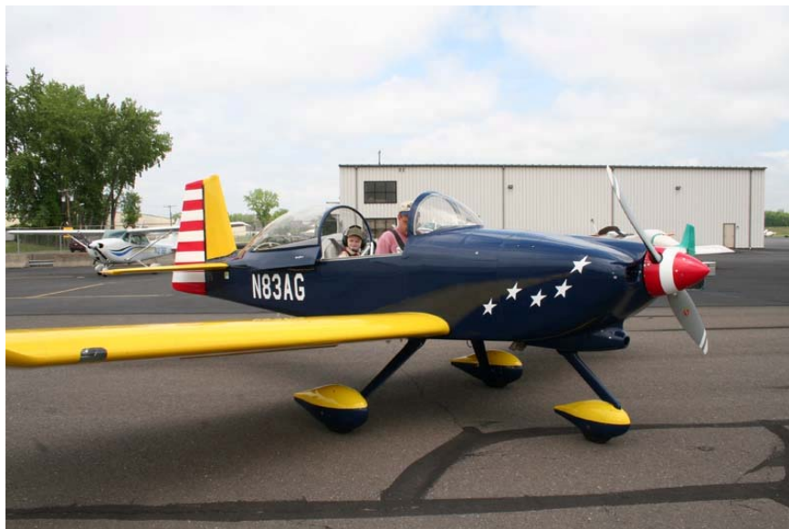
All buckled up and ready to go flying in the RV-8A.