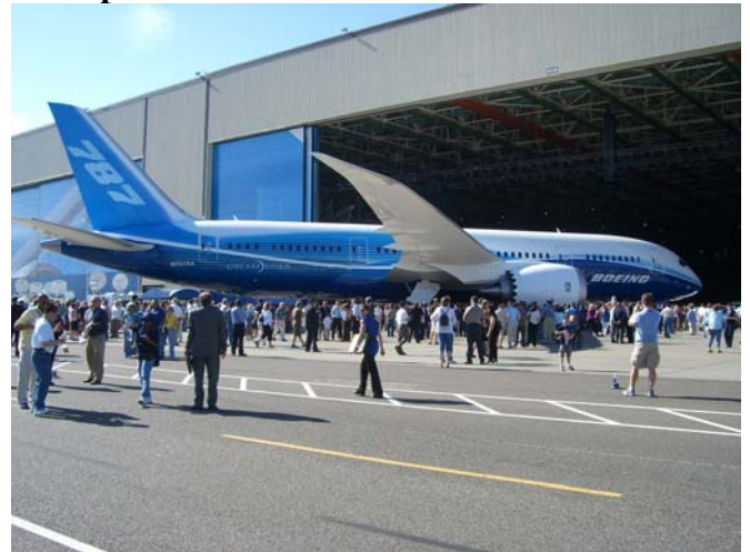
The 787 Rollout, now 26 months ago

Surprise! It's delayed. The first three airplanes can't be retrofit to production standard, becoming prototypes. The 777 program famously had no prototype, even the first airplane was refurbished and sold to JAL and is in service.